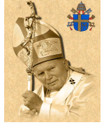
Blessed John Paul II

Enjoy your holidays! But make them also a period of constant and courageous effort to become better. Take advantage of this period of rest to strengthen your spirit too. Try with the help of divine grace always to be good, joyful and generous.