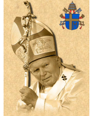
St. John Paul II

Hold school in esteem! Come to it joyfully; consider it a great gift, a fundamental right, which, of course, also involves duties. The right to education is the right to be fully human. Best wishes!